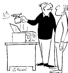
"This gets the v.f.o. stable in no time . . ."